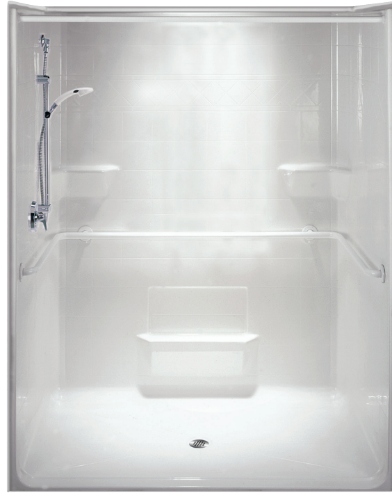
XST 6437 BF .75 WW 63" x 38.5" x 81.25" one piece gelcoat roll-in shower with 24" wing wall